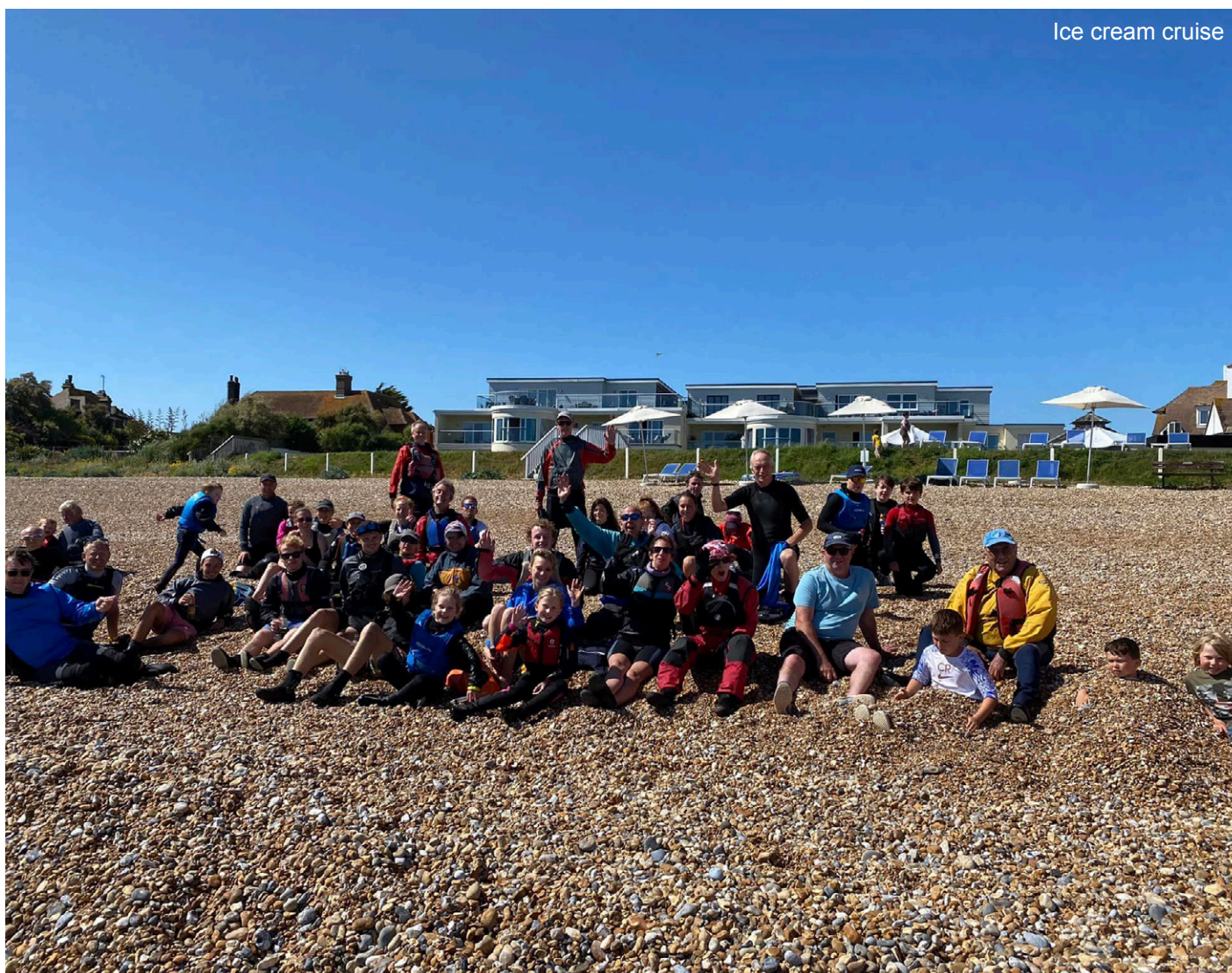
Ice cream cruise