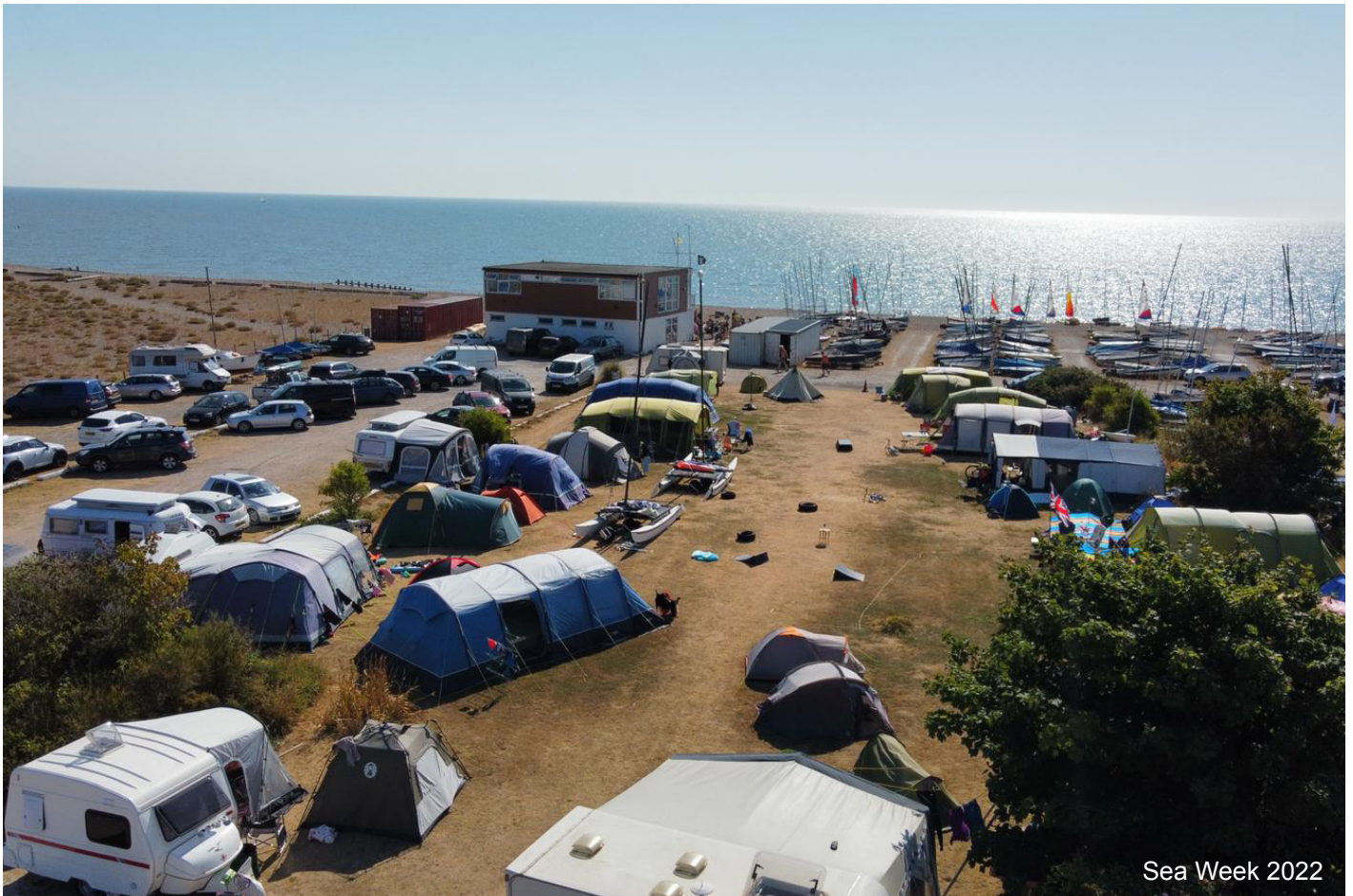
Sea Week 2022

This year we have gone retro on catering, and while the two Galleys will be available there is no formal meal provision, and members will need to come together to either plan meals, camp cook or order in.