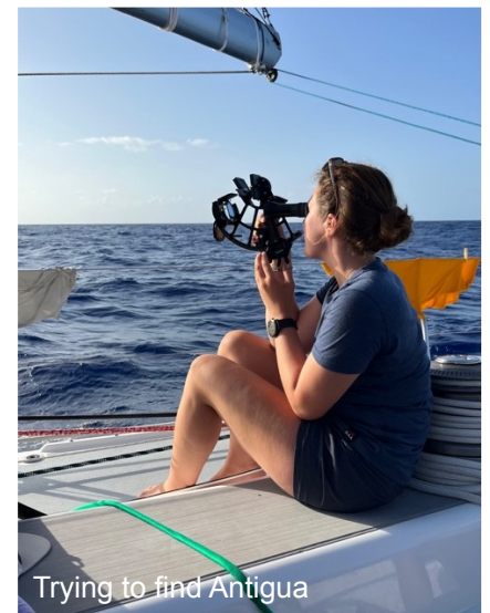
Trying to find Antigua

and repairs. Heading the other way this time from Marseille, through the straits of Gibraltar and up the coast to Porto to bring Phosphorus II (a one off Archambault A13) back to the UK illuminated the differences of luxury living on a brand-new Oyster to racing yachts. No boiling hot water taps, in fact no taps, or sinks! Washing-up involved throwing a bucket off the side for seawater. Despite the lack of luxury, I know what I prefer.