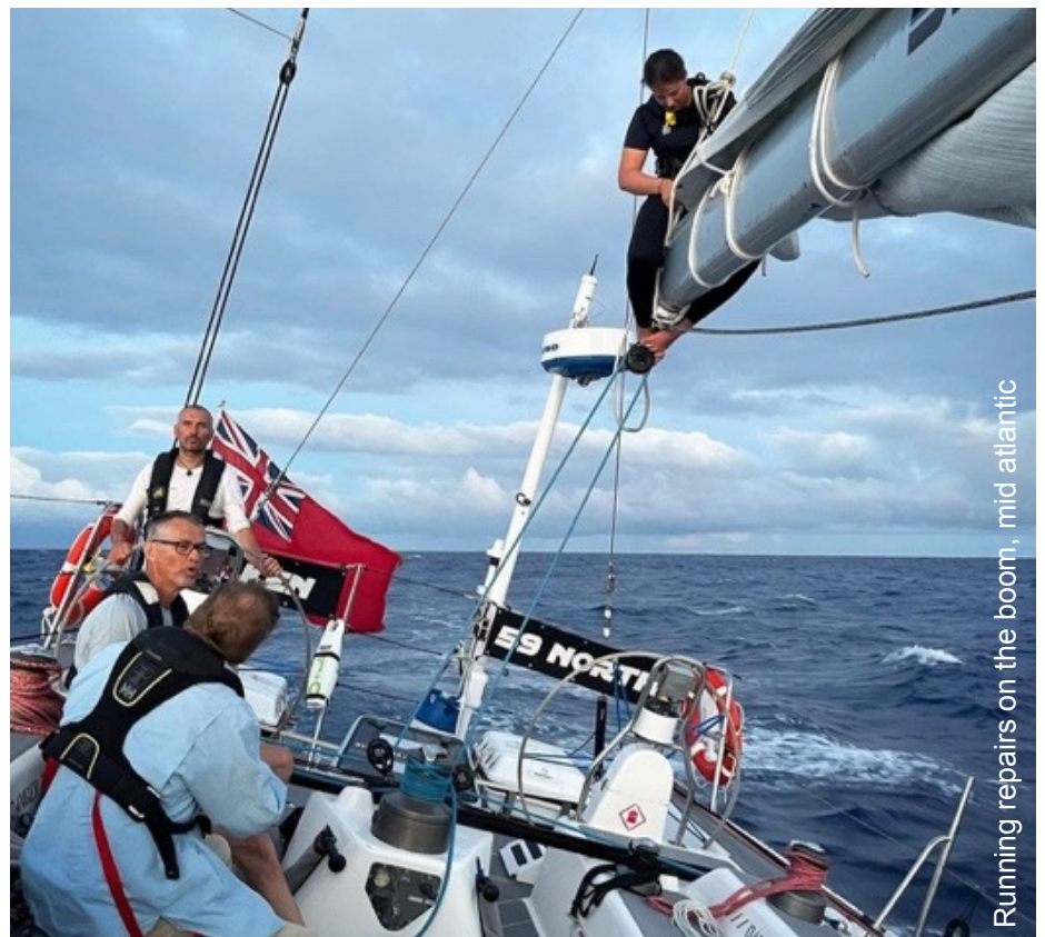
Running repairs on the boom, mid atlantic