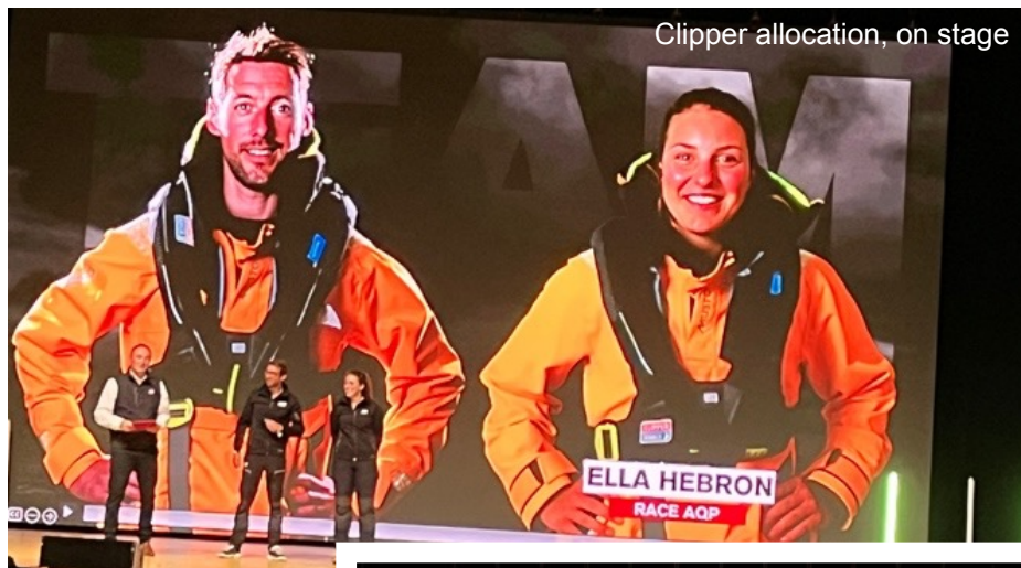
Clipper allocation, on stage

My 4th day working for Clipper Ventures was crew allocation, a big event at The Guildhall in Portsmouth, after some wise words from Sir Robin Knox-Johnson the 800 Clipper Race crew learnt who will be their Skipper and AQP. This involved the Skippers and AQPs being introduced