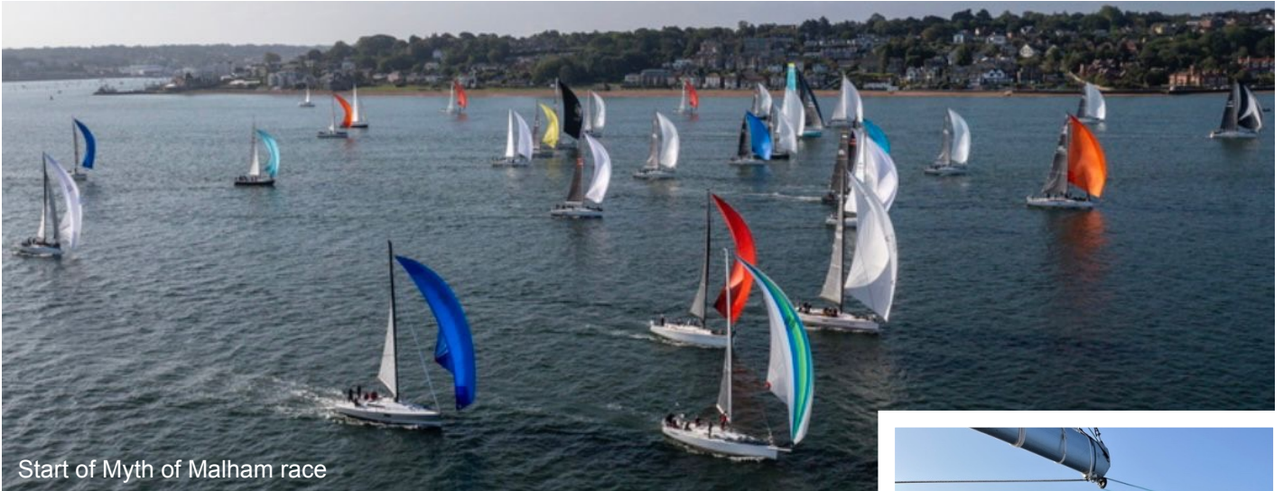
Start of Myth of Malham race