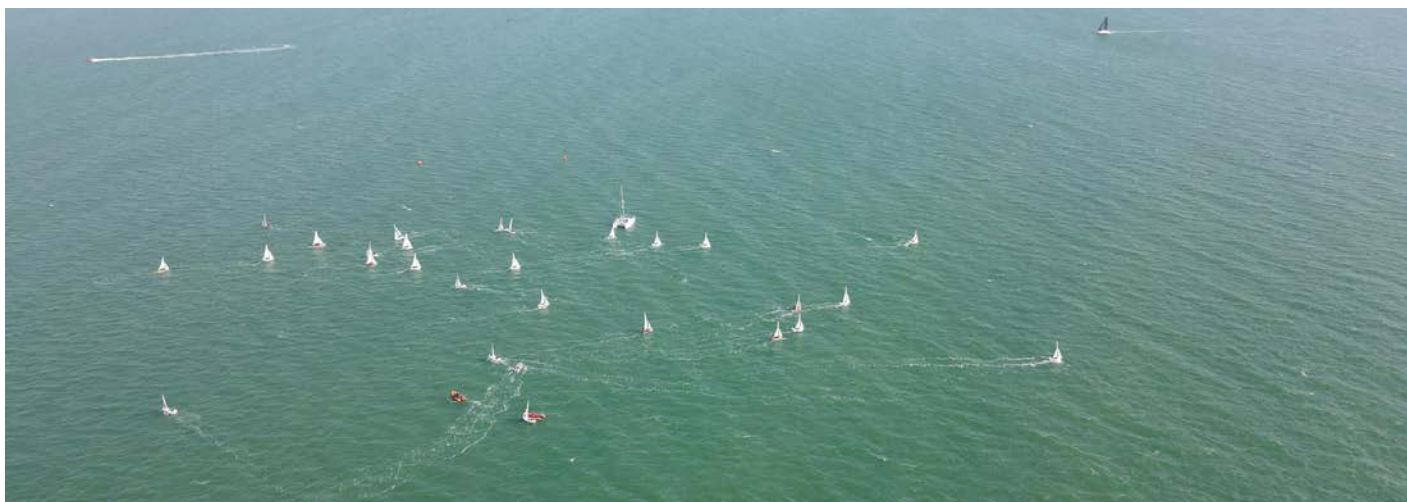
Photo taken from the drone at the Cadet Open

Finally, if anybody wants an input session on how to use the race management computer and/or enter results on Sailwave, please give me a shout. I'll happily meet you at the club one evening.