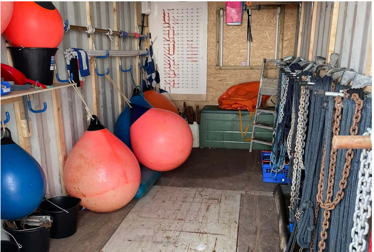
Southern end of new container

Finally, new windows will be installed in the galley, bar and lounge area on the first floor on 16th and 17th of May, which should help keep the first floor cooler in the height of summer!