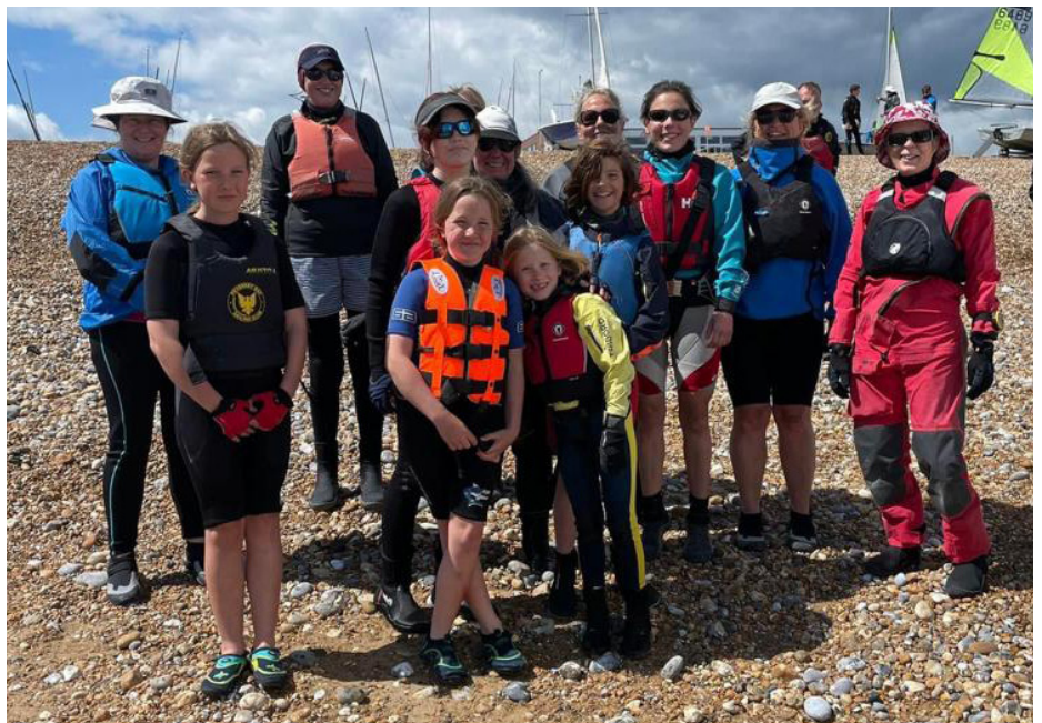
Members of Women on the Water (and youth sailors) off for a sail to Normans Bay.